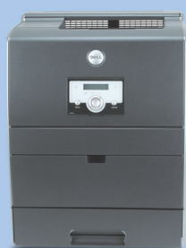
Dell Laser Printer 3100cn

The Dell Laser Printer 3000cn and the 3100cn are networked colour-capable laser printers priced competitively with similar-speed monochrome-only products. Designed for small workgroups, both printers offer fast printing speeds of up to 25 A4 pages per minute in monochrome and 5 A4 pages per minute in colour. Both printers come with built-in Ethernet networking and a robust 45 000 page monthly duty cycle to meet workgroup print requirements. The 3100cn offers additional paper input capacity, extra font capability and higher-capacity toners for maximum print economy. Both printers are quickly and easily expandable with the optional duplex unit (to enable printing on both sides of the paper), additional input capacity for a maximum of 900 sheets and upgradeable memory up to 576 MB. Running costs are low with competitive cost per page in both monochrome and colour print modes.